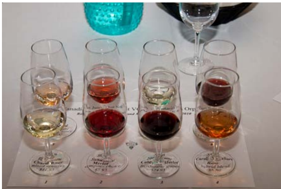
The tasting wines displayed a delightful rainbow of hues.

Who better to tell us about orphan wines? Orphan wines is a term the OVA uses to describe wines made from 100% Ontario juice but which do not qualify for VQA designation. The VQA is an application system of the Ontario grape wine industry. It regulates the quality of Ontario grape wines through tasting and testing. Not all grape wines pass the tests so they cannot put VQA on the label. Also, wines made with other fruits, berries, dandelions or honey do not qualify to be VQA.