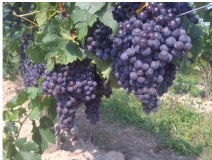
Niagara's Bounty

admission pass for $18.00 (inclusive of tax) in advance from Club Roma. The general admission pass includes 20 sample tickets to redeem for wines and foods. Participants may buy more tickets at the event. Doors will open at 7:00 p.m.