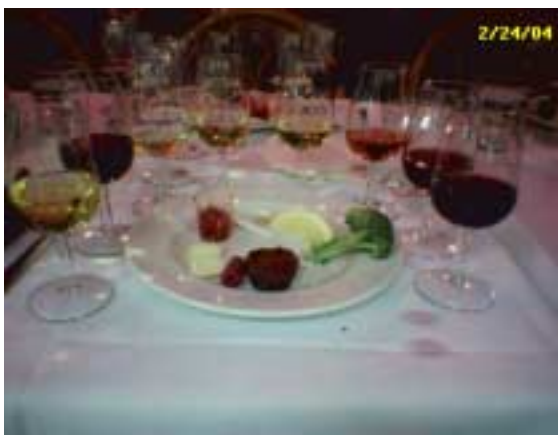
The foods included a lemon slice, brie cheese, broccoli, salt, sugar, parmesan, pound cake, raspberries and salsa.

The Vincor wines, from the Wine Rack and the Winery, included Jackson-Triggs Cuvée Close 2001 (Chardonnay, Pinot Noir and Riesling in a blend, a finely tuned but softer wine, ideal for receptions – which is when we had it), Inniskillin Riesling Reserve $12.95, Jackson Triggs Grand Reserve Meritage 2001 $24.95, Jackson Triggs Special Select Late Harvest Vidal 2002, $18.95/375ml, Jackson Triggs Methode Classique $24.95, Inniskillin Founders' Reserve Chardonnay 2000 $29.95, Sawmill Autumn Blush $6.75, Inniskillin Gamay Noir 2002, $10.95, and Olera port style $9.95.