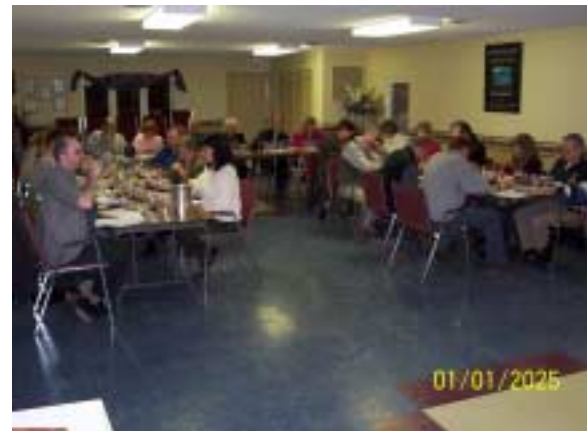
The tasting scene at Lakeview Cellars.

The tasting was blind as usual, and in the end, the results were a bit shocking! The votes for "favourite" wine were fairly evenly scattered among most of the wines, with little variance for price (ranging from $12 / 750ml to $40 / 750ml) except for one wine: the non-vintage, Magnotta Cabernet Sauvignon "box-of-wine" brought in a total of 7 votes as "favourite" wine! (Occasionally we may include something that doesn't quite fit the parameters of the tasting if it might prove to be interesting, or discussion worthy; and this was it.)