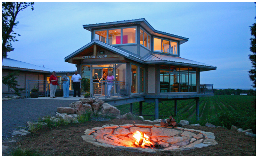
Flat Rock Cellars