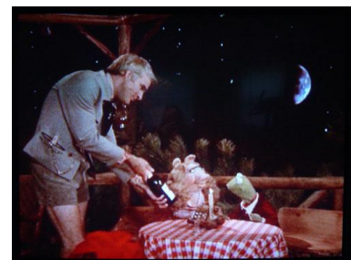
Steve Martin, Miss Piggy, Kermit the Frog in the Muppet Movie