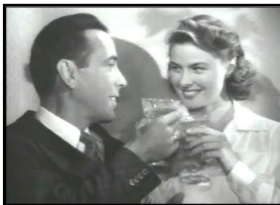
Humphrey Bogart, Ingrid Bergman in Casablanca

For example, her first movie clip in "Sipping with the Stars" is the Champagne toasting scene from the 1942 movie Casablanca starring Humphrey Bogart and Ingrid Bergman, www.youtube.com/watch?v=bW2o2aZkCyc . In that clip, Bogart says his famous line "here's looking at you kid", while he and Bergman toast each other with Champagne.